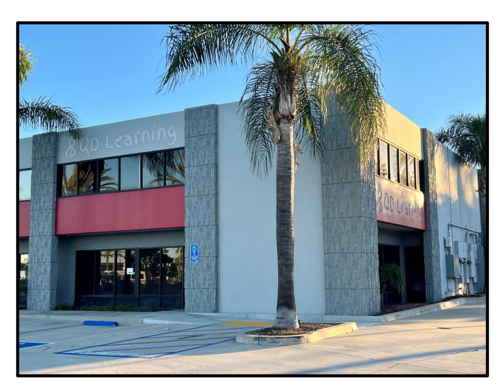
1086 N. Tustin Ave., Anaheim, CA